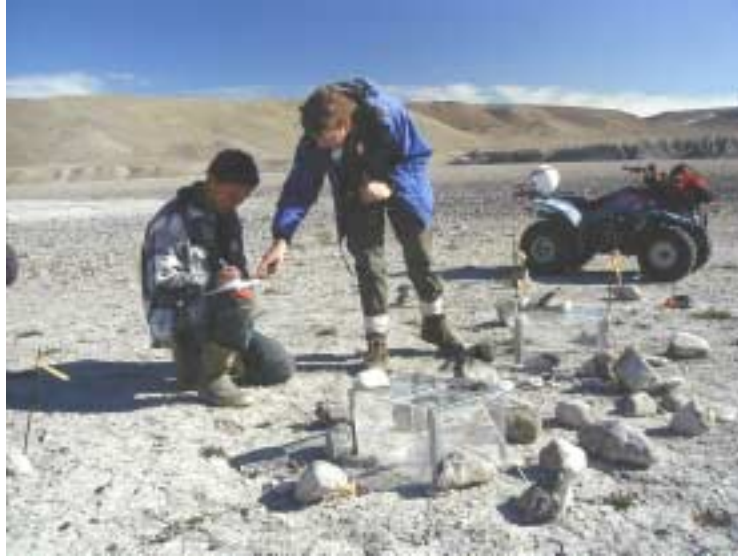
Figure 4. Tending sensors that periodically log data at a remote site, about 10 km from FMARS.

With this understanding we can then begin to inquire about the implications for Mars surface operations. How often must the biologist revisit this site? Could a rover with a speech-understanding program provide the same assistance in logging data? Could the camera be connected to the communications channel, so the biologist's statements would be directly associated with given photographs? How would the photographs be integrated into a site record over several years and these integrated into the expedition's overall study of the crater? Should the observations and photographs be directly transmitted by wireless link to base camp? Is this data to be considered non-public until publication or is it available for immediate release on the expedition's web site? Would it be possible to eliminate the return visits to some sites by continuously transmitting the sensor data to base camp and then having a robot retrieve the sensors when the experiment is complete? These are the issues and design possibilities that arise from the simple process of following a scientist in the field, observing how work normally occurs, and considering the implications for Mars.