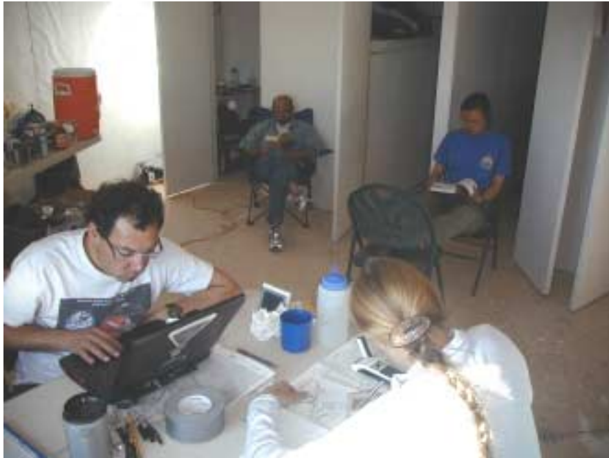
Figure 3. Example observation relevant to analog studies in the hab. Four crew members are working independently on the upper deck in the late afternoon. View is towards the west, showing staterooms with open doors (cf. Figure 1).

This example illustrates that different researchers will adopt different perspectives for experimenting with and studying the hab. The dimensions listed above could be used in a request for proposals to indicate relevant areas of interest; the science committee could prioritize these areas depending on activities planned for a given field season. In general, proposals should be sought that strive for synergy (relating simultaneous experiments), balance (covering the range of possible research dimensions), and system integration (understanding and designing for interactions between facilities, organization, procedures, and technologies).