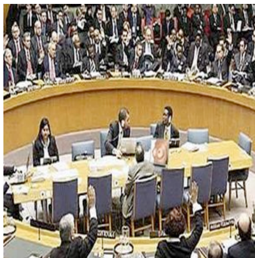
The Security Council will discuss three separate Sudan resolutions from the U.S.

Chomsky's seminal tome on Mideast politics has become a classic Noam Chomsky They Dare to Speak Out: People and Institutions Confront Israel's Lobby How Israel shapes U.S. foreign policy and influences presidential elections Paul Findley FOREX Trading Systems - 85%+ profitable trades State of the art trading software for FOREX. Autotrade through brokers or trade yourself. Live signal service www.indiciatechnologies.net FOREX Trading Systems - 85%+ profitable trades State of the art trading software for FOREX. Autotrade through brokers or trade yourself. Live signal service www.indiciatechnologies.net