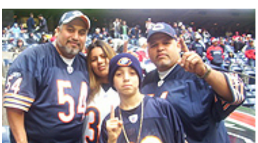
Get your Bears on