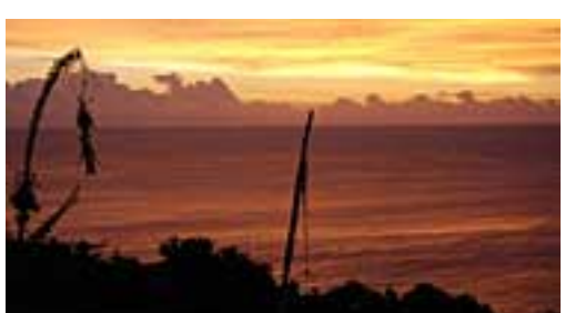
Your travel photos