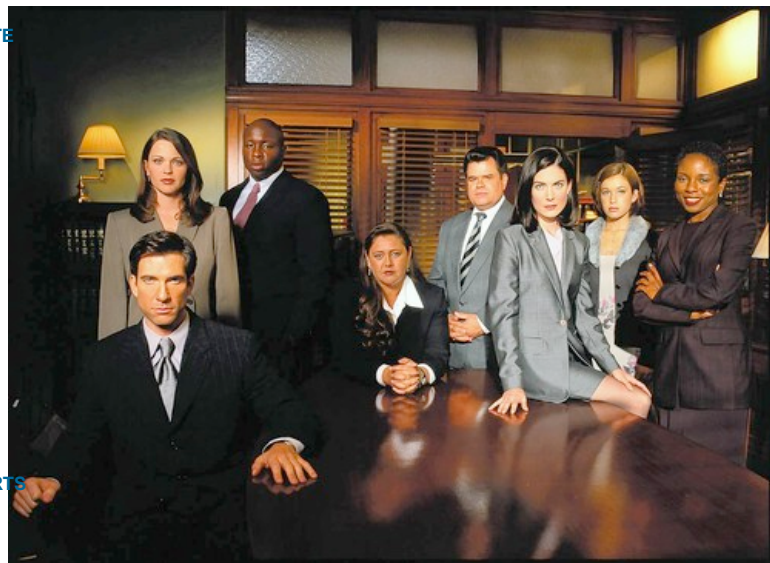
The cast of "The Practice" (back row, left to right): Kelli Williams, Steve Harris, Camryn Manheim, Michael Badalucco, Lara Flynn Boyle, Marla Sokoloff and Lisa Gay Hamilton.

Plunging necklines. Teensy skirts. Too-loud ties. It all sounds like fodder for "Project Runway" rather than a gathering of distinguished jurists, but judges are weighing in on the topic of proper courtroom attire.