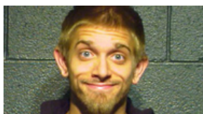
Mugs in the news