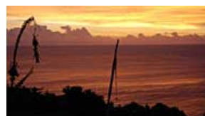
Your travel photos