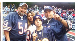
Get your Bears on