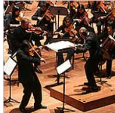
Bows and High Fives as East Meets West