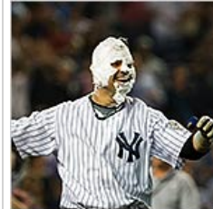
A Pie in the Face Is the Newest Yankee Tradition