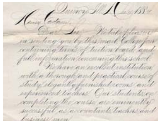
Spencerian script from 1884.

The Palmer Method was gradually supplanted when educators decided to teach children manuscript (or printing) first, and cursive later, to get them started writing younger. Handwriting enthusiasts consider the end of the Palmer Method to be the end of good handwriting in America.