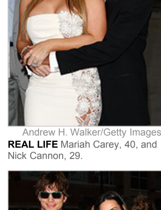
REAL LIFE Mariah Carey, 40, and Nick Cannon, 29.