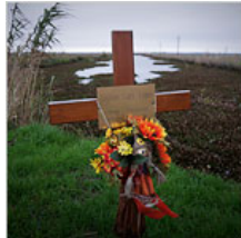
8 Deaths in a Small Town, and Much Unease