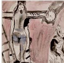
Small Museum Captures a Rare Chagall