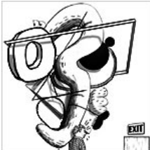
Op-Ed: The Art of the Deal