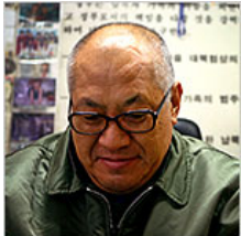
Serving a Father by Bringing Koreans Home