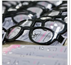
Better Vision for the World, on a Budget

Home | World | U.S. | N.Y. / Region | Business | Technology | Science | Health | Sports | Opinion | Arts | Style | Travel | Jobs | Real Estate | Automobiles Back to Top