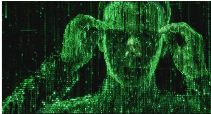
Mind Trip Intel wants into your brain Warner Bros.

By Jeremy Hsu Posted 11.20.2009 at 3:00 pm