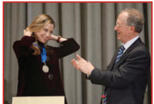
Mira Sorvino, new Goodwill Ambassador to Combat Human Trafficking, being congratulated by Exec. Director of UNODC, Antonio Maria Costa.

To increase public awareness of human trafficking and rally the world to fight it, Mr. Costa appointed Academy Award-winning actress Mira Sorvino as a Goodwill Ambassador to Combat Human Trafficking. "We know that Mira's commitment to the plight of trafficking victims will move people to take action against modern-day slavery," said Director Costa. ( http://www.unodc.org/unodc/en/frontpage/unodc-report-on-human-trafficking-exposes-modern-form-of-slavery-.html )