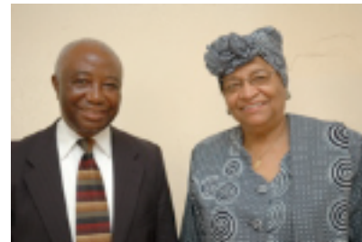
Joseph Boakai and Ellen Johnson-Sirleaf

Liberia has held an historic election, with another first for Africa- a woman president. On the 23rd of November, Ellen Johnson Sirleaf and her vice president Joseph Boakai were declared to have won the run-off election held November 8.