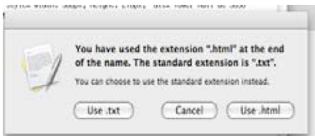
FIGURE THREE: If you are alerted, choose the Use .html option .