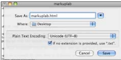
FIGURE TWO: Save the file as markuplab.html and leave the encoding as the default.