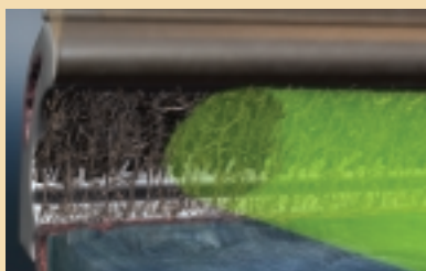
The SLT laser is applied to trabecular meshwork, at the boundary of the iris.