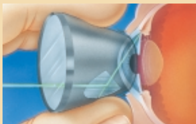
A lens is placed over the eye to direct the light to the trabecular meshwork.

SLT is usually performed in the physician's office and only takes a few minutes. Prior to the procedure, eye drops will be given to prepare the eye for treatment. The laser applications are made through a special microscope, similar to the one used for eye examinations.