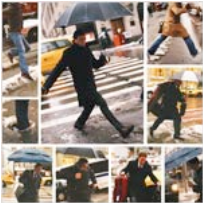
On the Street: The Water Dance