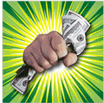
Getting Theirs Cuts Both Ways on Wall Street