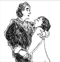
Op-Art: Lost and Found New York