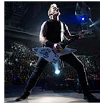
Lions of Metal, Still Thrashing With Purpose

A Bloggingheads debate on the meaning of Barack Obama's offer to "extend a hand" to despots willing to unclench their fists.