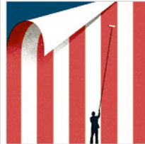
The Big Fix