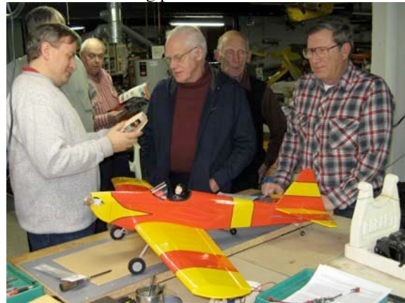
Checking out the nacelle and retracts

Unfortunately, we didn't come up with any possible working solution for him, but we did admire the retracts! They will be a very nice addition to this model and make getting it into the air a bit easier and safer.