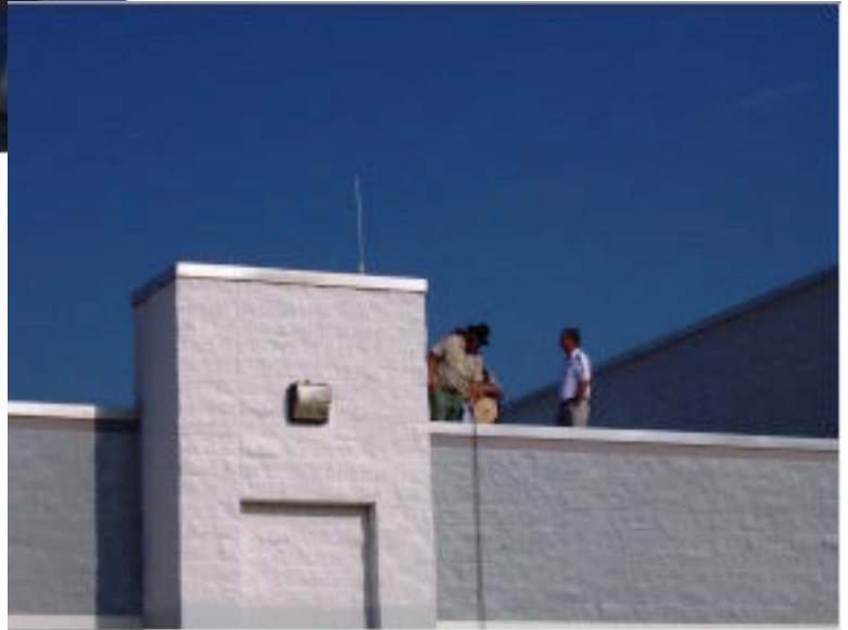
RIGHT: Finished antenna on top of the school.