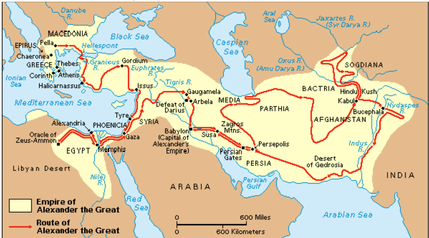
From World Book © 2002 World Book, Inc., 233 N. Michigan Avenue, Suite 2000, Chicago, IL 60601. All rights reserved. World Book map