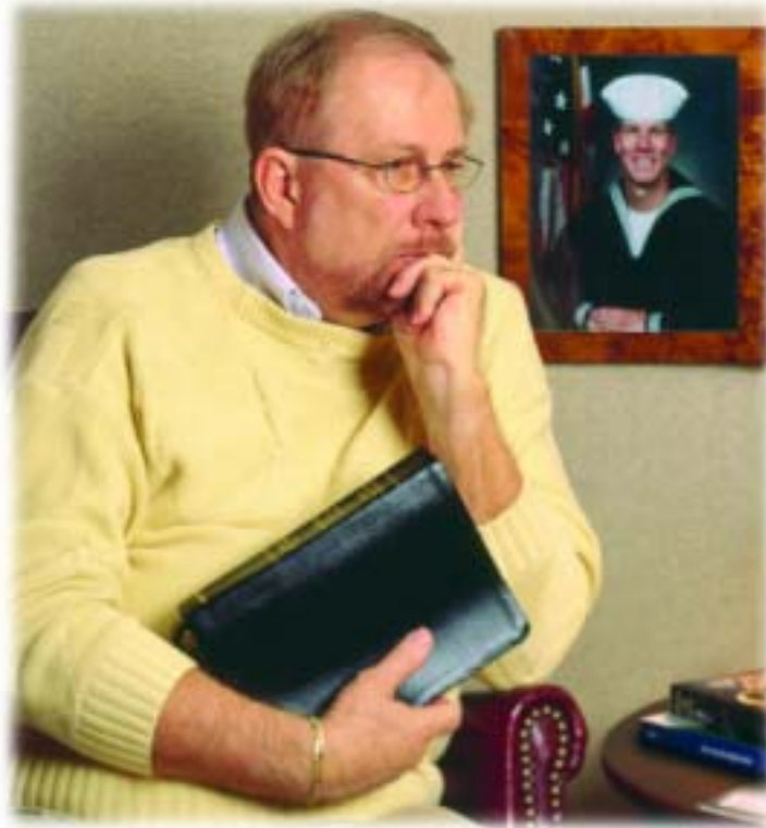
As menacing international developments cause anxiety, Christians need to prayerfully consider when engagement in warfare may be morally acceptable, and when it may not.

Formal declaration. Since the use of military force is the prerogative of government and not of private individuals, properly constituted procedure for declaring and waging war must be followed. As Thomas Aquinas commented, “it is not the business of a private individual to declare war ... as the care of the common weal is committed to those who are in authority.”