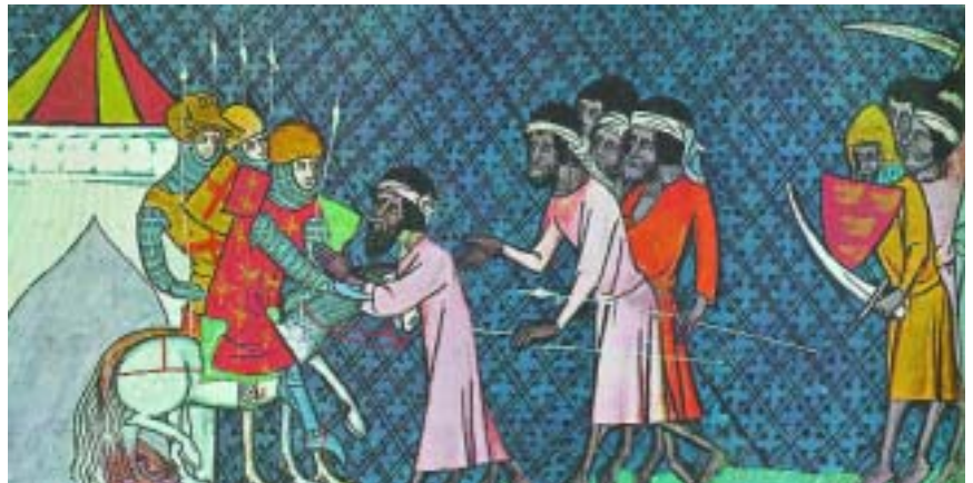
Over the past two millennia, Christians have reacted to international threats with every approach from the “holy wars” of the crusades to absolute pacifism.

While the Lutheran confessional writings do not treat the subject of war at length, they do contain significant references to it (for example, in Luther’s commentary on the Lord’s Prayer in the Large Catechism , in Article 21 of the Augsburg Confession , and in Article 4 of The Apology of the Augsburg Confession ).