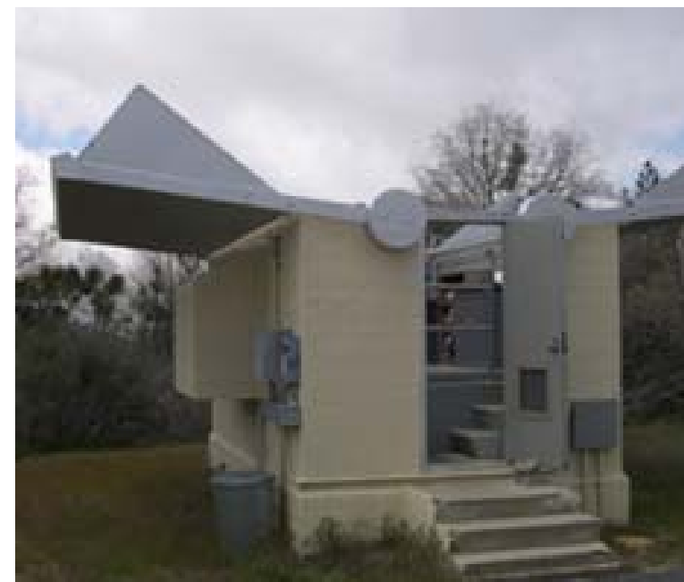
Sleuth - the smallest telescope at the Palomar Observatory .

For questions call (760) 742-2111, e-mail friendsofpalomar@astro.caltech.edu , or visit www.friendsofpalomarobservatory.org