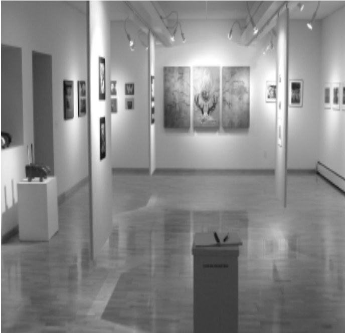
Art Faculty exhibit in the new gallery