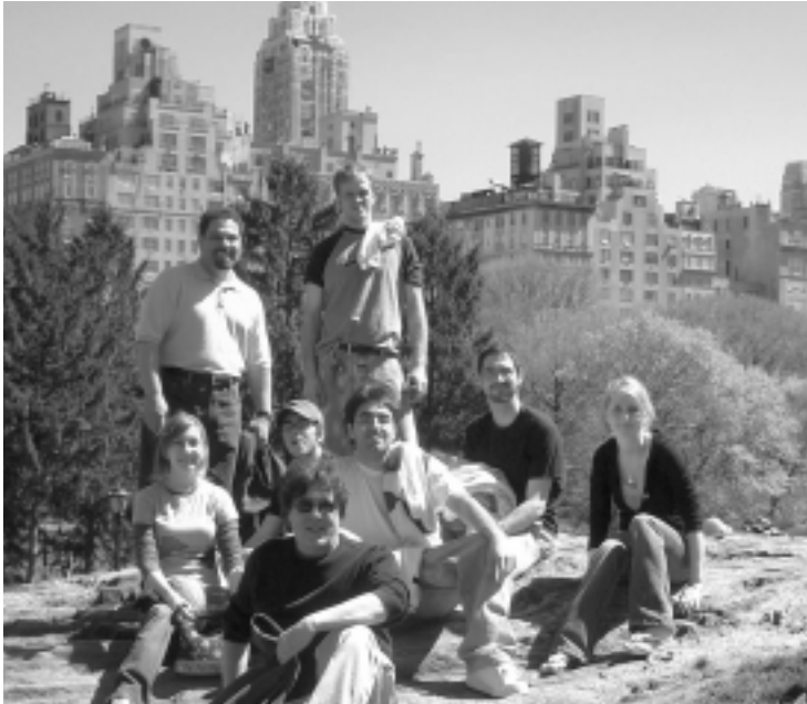
The Fine Arts Club in Central Park