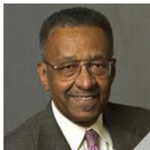
Walter E. Williams

Join the discussion! Click here to comment