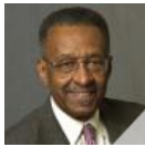
Walter E. Williams Updated 23 Mar 2011