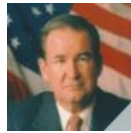
Pat Buchanan Updated 22 Mar 2011