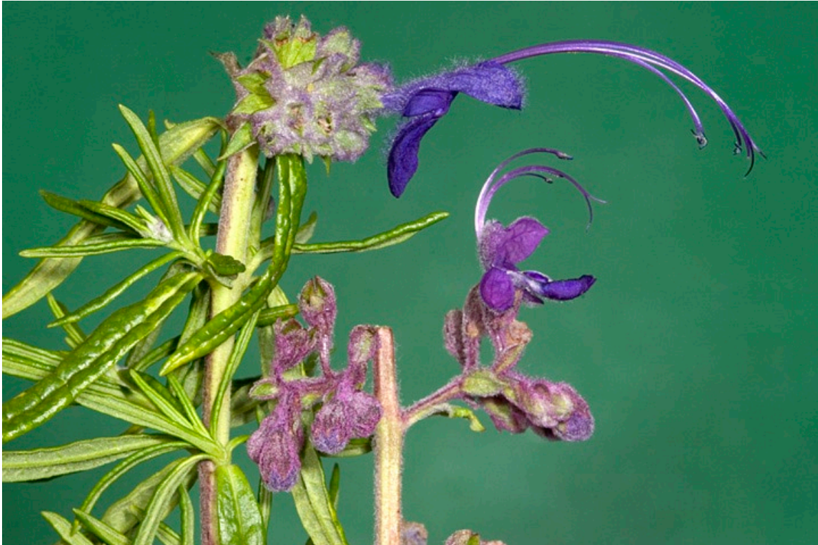
Left/Top: Trichostema lanatum . Right/Bottom: Trichostema parishii , Lamiaceae