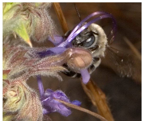
Trichostema lanceolatum with Anthophora urbana , Apidae.