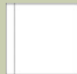
Graphic/Index No Safety-sleeve®